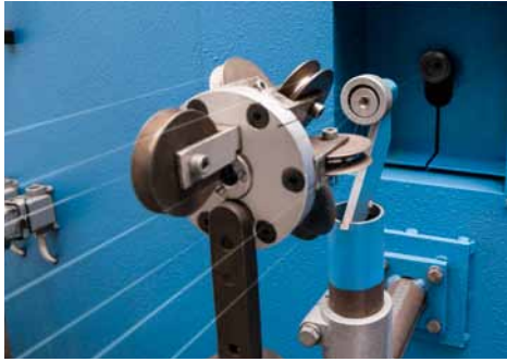
Signal and current transmission