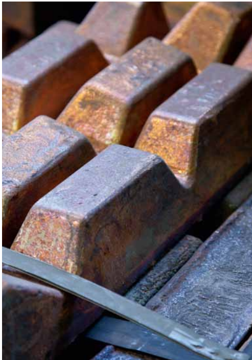
All of our alloys are made from pure nonferrous materials, e.g. Cu, Ni, Mn, Si, Cr, Al, Sn and Co.